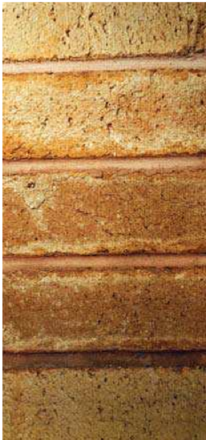
Fig. 3. In this example, a masonry prism was constructed using one batch of mortar. The top mortar joint was tooled immediately after placement of the unit. Remaining mortar joints were tooled at progressively greater time intervals and thus stiffer consistency. The relationship between mortar consistency when tooled and mortar color is quite apparent.

The effect of tooling on the appearance of a mortar joint is dependent on the type of jointer used and the stiffness of the mortar at the time it is tooled. Tooling of mortar when it is highly plastic or flowable will tend to pull a high-water-content paste to the surface, resulting in a porous light-colored joint surface. If the mortar is allowed to become stiff before tooling, the joint surface will not readily yield to the pressure of the jointer, and friction developing between the metal jointer and the mortar joint will result in a dark streaked surface. When tooled at the proper consistency, the surface of the mortar joint is compacted, and a uniform appearance consistent with the body of the mortar is achieved.