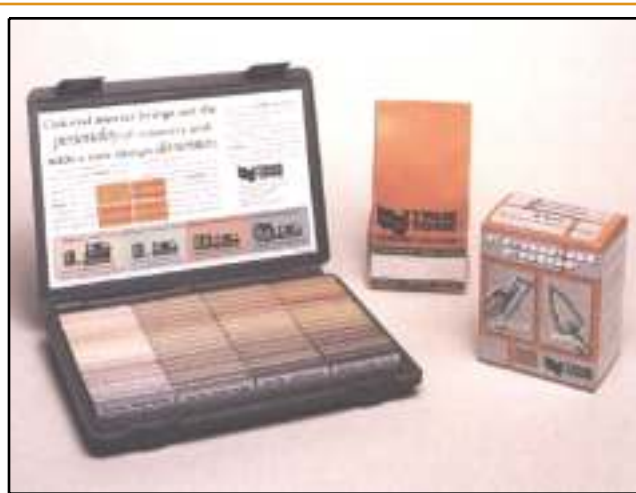
True Tone Sweet 16 Sample Kit and Dose-Sized Packages.

conditions, stable, and free of water soluble content (MC 89 contains up to 25% carbon).