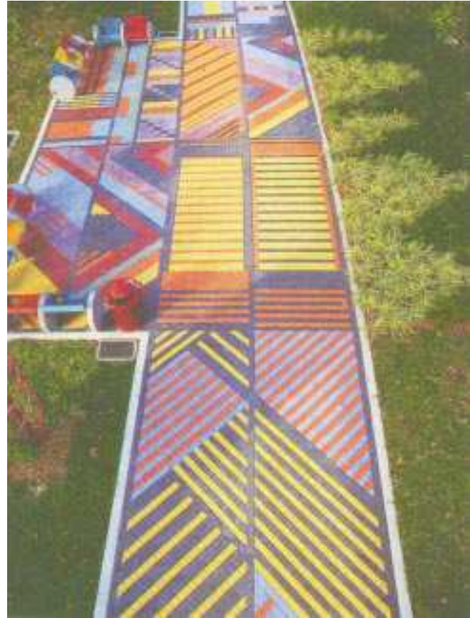
Project design by Wallace, Roberts and Todd.

DAYTON BEACH, FLORIDA , used pavers to support an increase in store occupancy and commerce.