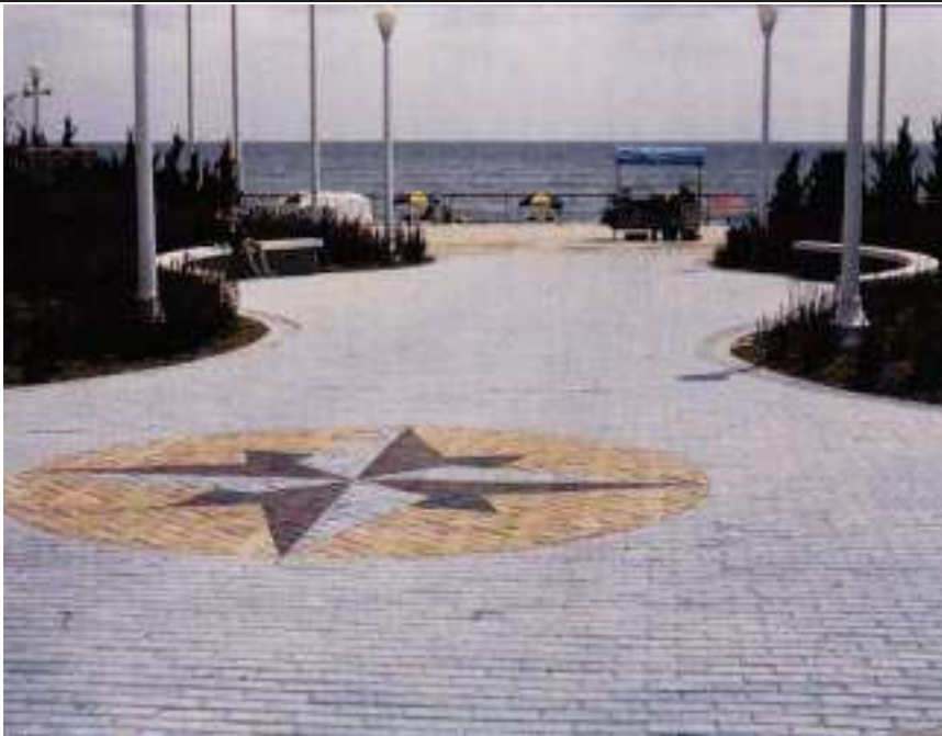
A promenade of pavers along Virginia Beach, Virginia, also connects the beach to the adjacent commercial strip.

The Dallas Farmer's Market , in Dallas, Texas , and City Market in Kansas City, Missouri , demonstrate the use of pavers to create a sense of place and direct people toward market entrances.