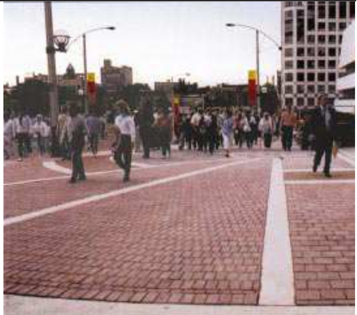
Civic events at the Toronto Skydome begin with concrete pavers at the entrance.