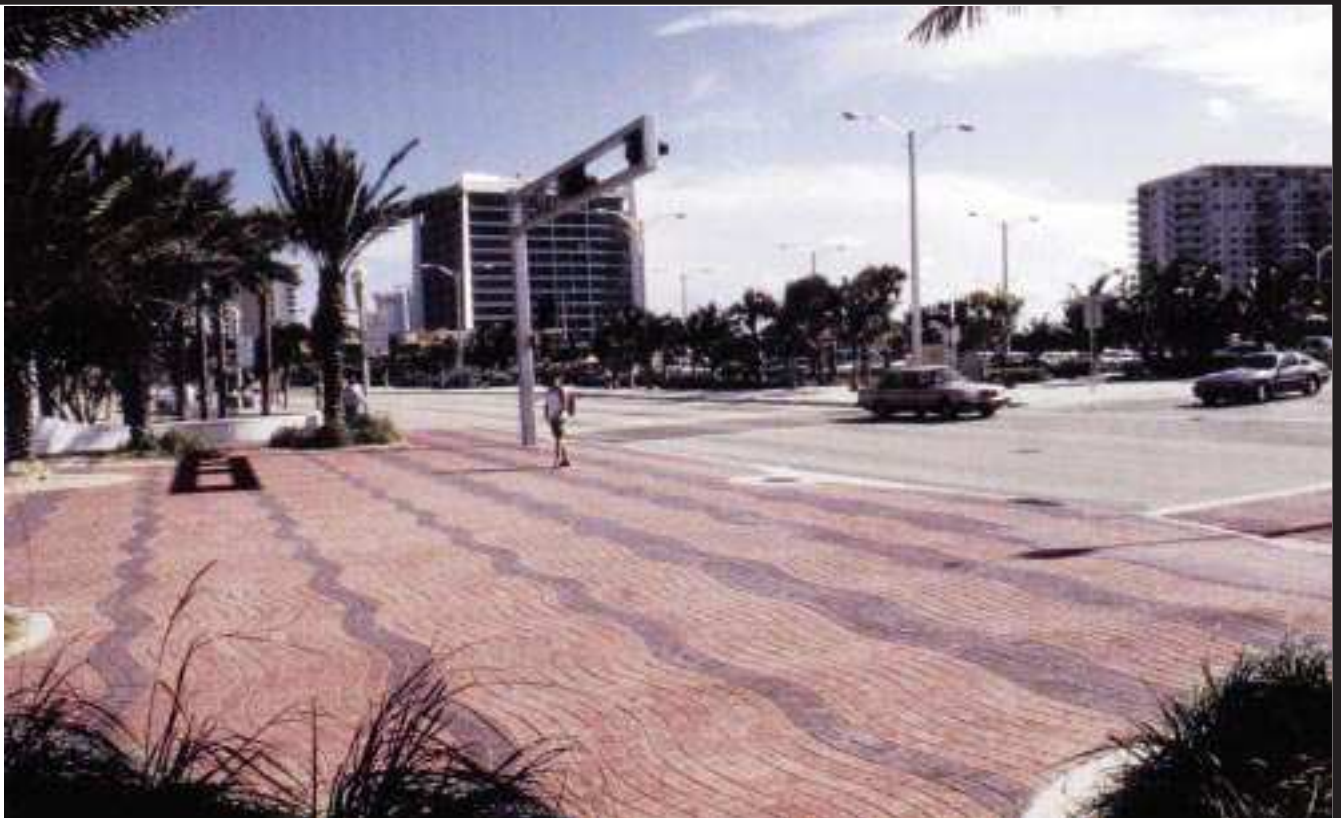
Colors and patterns of concrete pavers in Ft. Lauderdale, Florida, mirror the movement of ocean waves