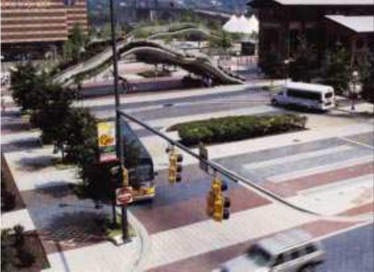
In Chattanooga, Tennessee, concrete pavers direct visitors to shopping, entertainment and the world class aquarium.

CHATTANOOGA, TENNESSEE , has transformed its downtown from an old industrial center to offices, entertainment and cultural facilities. Pavers create an impression essential for attracting suburbanites to enjoy the city's several museums, sports arenas, and an aquarium.