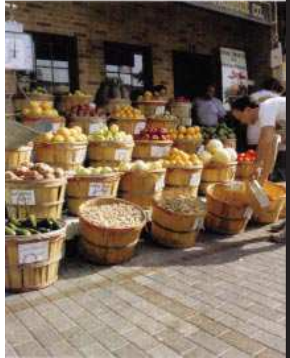
City Market, Kansas City, Missouri.