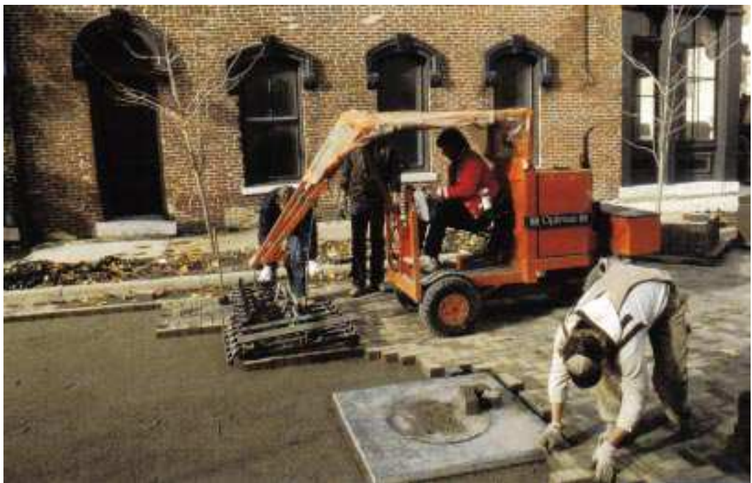
Dayton, Ohio, mechanically paved 11,000 s.f. (1,020 m 2 )