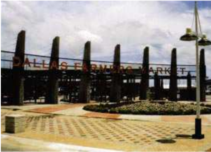
Dallas Farmer's Market, Dallas Texas.