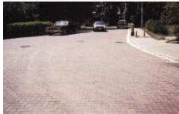
Pine Crescent, a residential brick street in an established, up-market neighborhood in Toronto, Ontario, was removed and replaced with 70,000 s.f. (6,500 m 2 ) of mechanically installed concrete pavers.