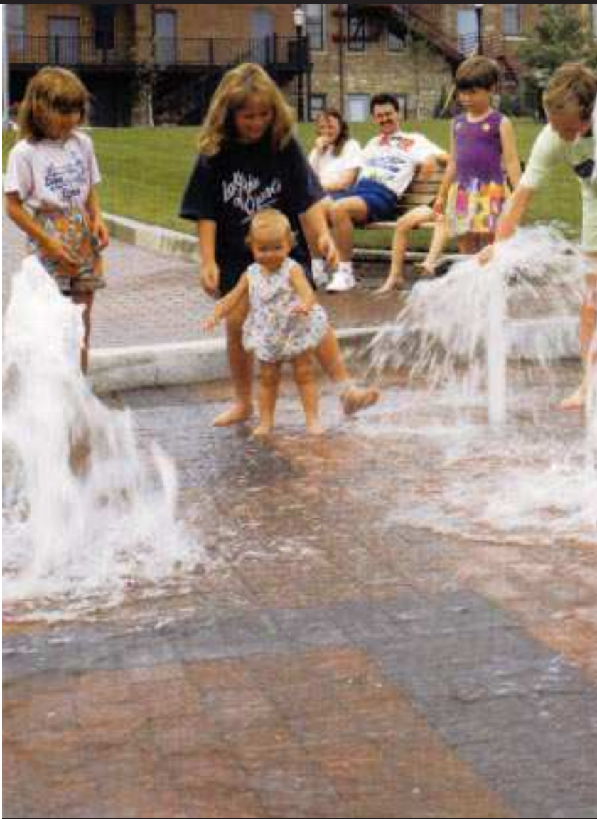
City Market, Kansas City, Missouri