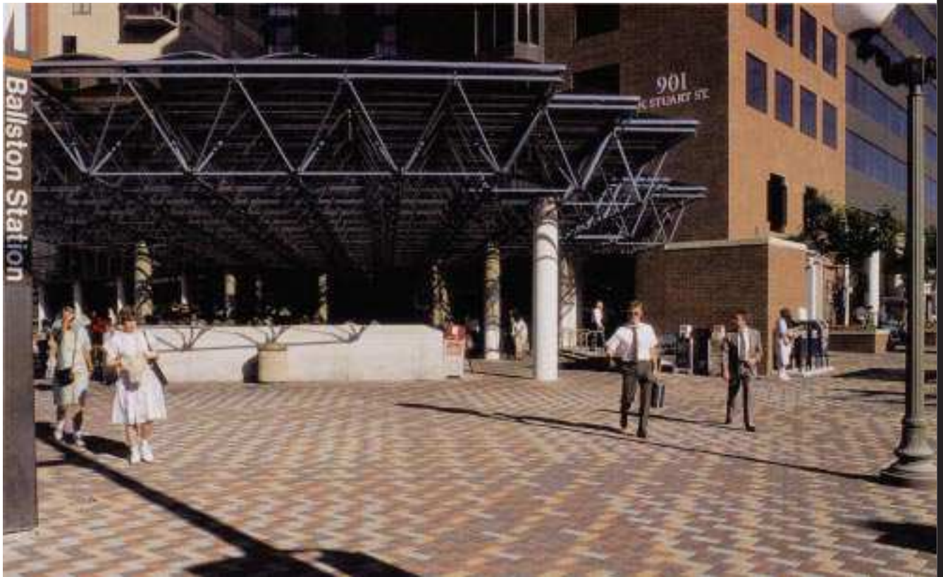
In Arlington, Virginia, Concrete pavers accent the Metro Station