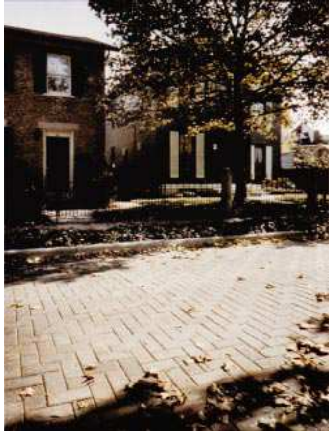
Dayton, Ohio, replaced an old street in its historic Oregon District with concrete pavers to match the old brick streets of yesteryear.

DAYTON, OHIO, and TORONTO, ONTARIO, have used concrete pavers in historic neighborhoods to enhance their image, and support the investment by residents in their homes.