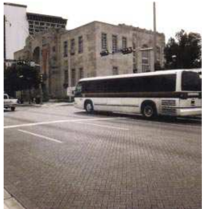
To enhance tourism and support buses, the city of San Antonio, Texas, chose durable concrete pavers for the downtown streets.

As part of a complete facelift for the downtown, the city required a pavement that would not rut from constant bus traffic, especially in high summer temperatures. Five miles (8km) of pavers met this need while visually unifying the historic downtown.