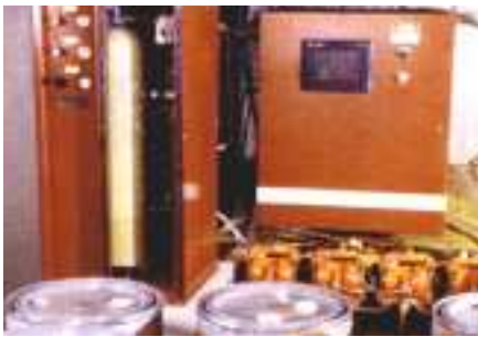
This liquid coloring system was recently installed at A-Block, a CMU producer in Needles, Calif. Liquid colors are drawn out of drums through a hose or pipe that set on top of the drums. Four pumps (center of picture) are used, one for each of the basic iron oxide colors. The cylinder in left cabinet rests on a load cell to meter the amount of liquid colors programmed into the control panel on right. Colors are then transported to the concrete mixer.

There are two methods for manufacturing liquid colors on-site at a concrete producer's facility. In the on-site slurry system, a concrete producer manufactures liquid colors in bulk. In the "dry-wet" system, dry-pigments are blended