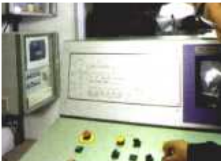
The control panel for the Granumat automated coloring system at Unilock Chicago (background) is linked to the plant's control system.