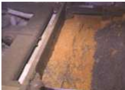
The choice between manual and automated coloring systems depends, in part, on the concrete producer's product line. Here, red and black batches of concrete mix together in the hopper above a paver machine to produce multi-colored concrete paver units.

in water on a batch-by-batch basis. Both of these methods combine some of the features typically associated with both dry powder and liquid coloring systems. On the plus side, they both allow the use of low-cost powder pigments plus the flexibility of being able to locate coloring operations away from the concrete mixer. On the minus side, they still have most of the dusting concerns that come from handling dry pigments.