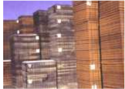
Color is a value-added feature for concrete products. A wide range of coloring systems are available to meet the needs of all concrete producers.

Powders are packaged in a wide variety of sack sizes ranging from one pound bags to 2,000-pound "super-sacks." Many pigment producers will also prepare customized "batch-sized" bags for their ready-mix customers. In the past few years, disintegrating bags have become the standard packaging for ready-mix producers. Disintegrating sacks have solved most of the ready-mix producer's concerns about cleanliness, but are not compatible with other types of concrete operations. Disintegrating bags can be tossed into a ready-mix truck without opening or pouring. The bags travel to the center of the mix where