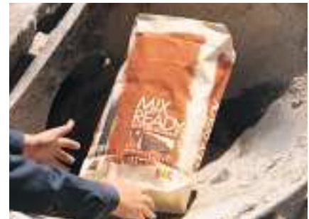
Disintegrating bags with powdered pigments are increasingly popular among ready-mix producers. The pre-measured bags can be thrown into mixers without opening or pouring and are a clean and convenient way to color ready-mix concrete.