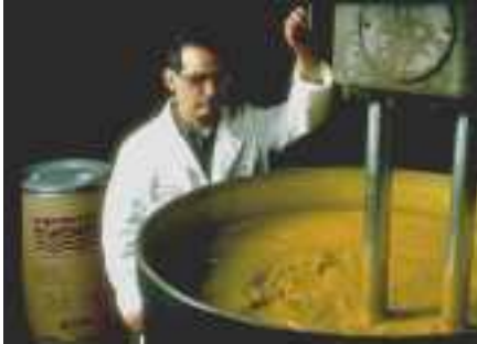
Liquid colors, also called slurries, are manufactured by mixing powdered pigment and dispersing agents in water using high-shear blenders.