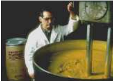
Liquid colors, also called slurries, are manufactured by mixing powdered pigment and dispersing agents in water using high-shear blenders.