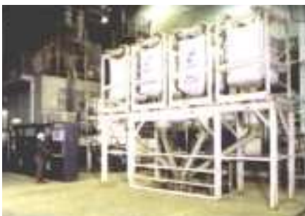
A four-color Granumat machine is used at Pavestone, Denver to color concrete pavers. Pigments in supersacks flow into a color metering system located below the production floor. There, granular pigments are weighed, blended and pneumatically transported to the concrete mixer. The very low amount of dust in granular pigments helps keep the plant clean and efficient.