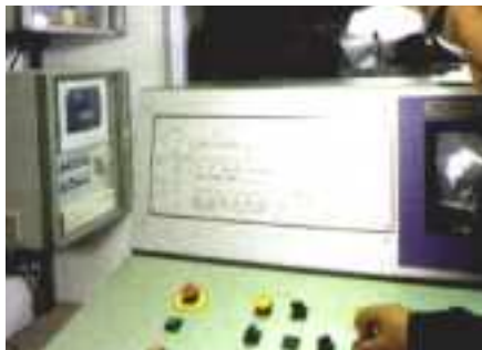
The control panel for the Granumat automated coloring system at Unilock Chicago (background) is linked to the plant's control system.