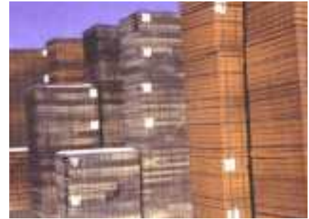
Color is a value-added feature for concrete products. A wide range of coloring systems are available to meet the needs of all concrete producers. (Photo of Unilock Chicago, Aurora, Ill.)

Powders are packaged in a wide variety of sack sizes ranging from one pound bags to 2,000-pound "super-sacks." Many pigment producers will also prepare customized "batch-sized" bags for their ready-mix customers. In the past few years, disintegrating bags have become the standard packaging for ready-mix producers. Disintegrating sacks have solved most of the ready-mix producer's concerns about cleanliness, but are not compatible with other types of concrete operations. Disintegrating bags can be tossed into a ready-mix truck without opening or pouring. The bags travel to the center of the mix where