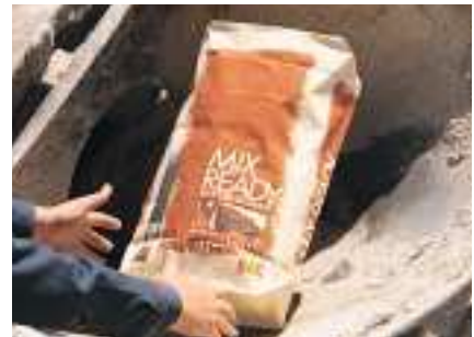
Disintegrating bags with powdered pigments are increasingly popular among ready-mix producers. The pre-measured bags can be thrown into mixers without opening or pouring and are a clean and convenient way to color ready-mix concrete.