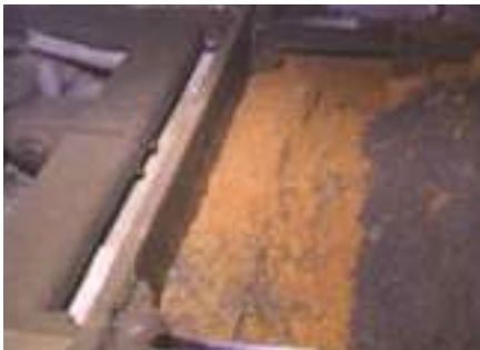
The choice between manual and automated coloring systems depends, in part, on the concrete producer's product line. Here, red and black batches of concrete mix together in the hopper above a paver machine to produce multi-colored concrete paver units.

in water on a batch-by-batch basis. Both of these methods combine some of the features typically associated with both dry powder and liquid coloring systems. On the plus side, they both allow the use of low-cost powder pigments plus the flexibility of being able to locate coloring operations away from the concrete mixer. On the minus side, they still have most of the dusting concerns that come from handling dry pigments.